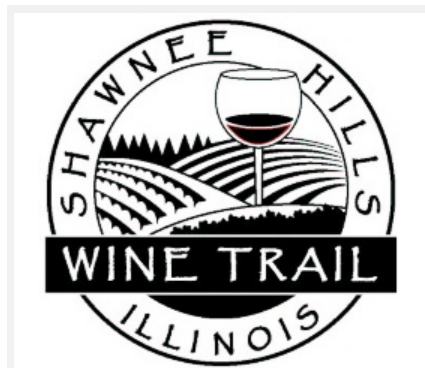
Join your hosts along the Shawnee Hills Wine Trail