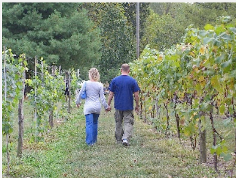
Romantic getaways are just one of the options for visiting the wine trail