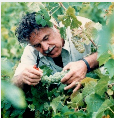
Family owned, personal attention are among the reasons the 12 wineries/vinards of The Wine Trail are a worth while destination

The green and lush rolling hills of southern Illinois, rich full vines draped with plump grapes, sunny days and romantic sunsets provide the backdrop to the wineries along the Shawnee Hills Wine Trail. Twelve distinct settings from which to choose, 12 personalities to invite and tempt you to come in and stay awhile.